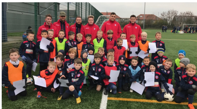
Inspiring the Future - the 2010 and 2011 squads enjoyed a visit from the First Team at their last training session of 2018

We thank all our volunteers who attend SFA Coaching Courses to be the best coaches for our players and for working with us to be the best we can be and to retain this prestigious award.